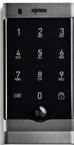
OCS®SMART Graphito Handle