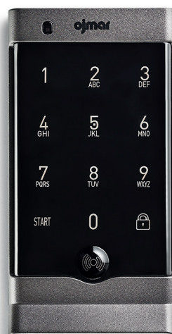
OCS®SMART Graphite Handle