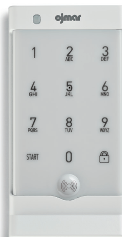
OCS®SMART White Handle