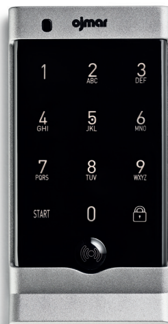
OCS®SMART Silver Handle