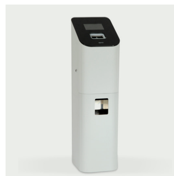
STRAP RETURN UNIT