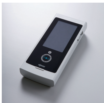
NFC WIRELESS PROGRAMMER